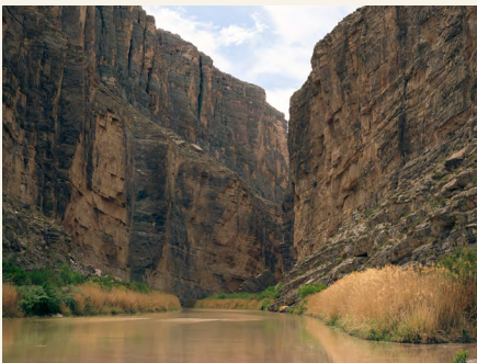
SANTA ELENA CANYON

Just a short drive from camp, Big Bend National Park is one of Texas' most breathtaking escapes. It's a mix of canyons, rivers, and desert that shifts color with every hour of light. If you're looking to explore before, during, or after the festival, here are a few favorite spots to check out: