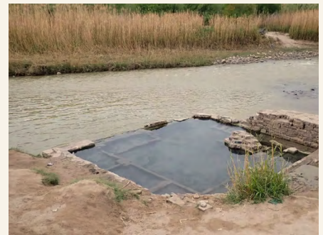
BOQUILLAS HOT SPRINGS